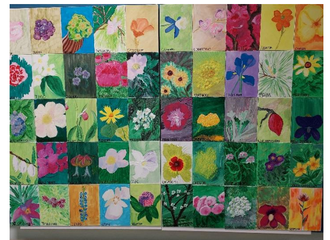
Art is alive and well at Marian Woods. Turn to page 5 to see more!